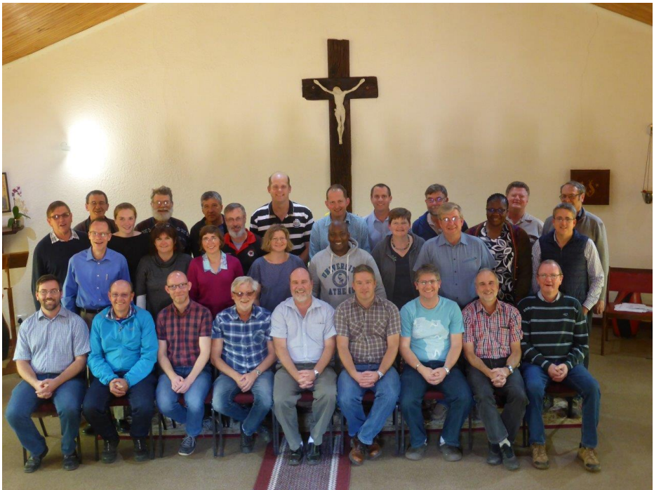
ELKSA (N-T) Pastors' convention 2018