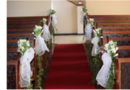
Our beautiful church ready for a wedding